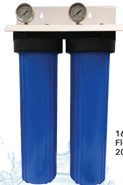
160197 High-Flow Dual Stage 20BB SED, Carbon